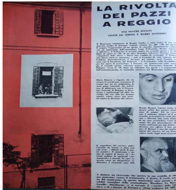
Figure 1. Page of Le Ore. Settimanale fotografico d'informazione, 15 May 1953.

Roman writers; 2 then he returned to Italy, in Rome, in the 1960s, finding in the city of Pasolini, Moravia and Flaiano the ideal basis for touring the world and being always present at the most important events of history and politics and for keeping on following his humanist vocation and cultivating his passion for social reportages.