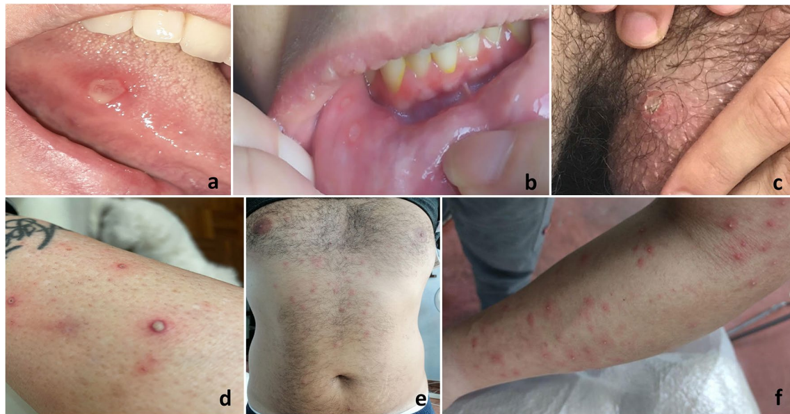
Fig. 1 Mucocutaneous manifestations in Behcet's disease: minor oral ulcer with a yellow base under the tongue, surrounded by an erythematous halo (a); multiple minor oral ulcers located on the buccal mucosa (b); single oval ulcer of the scrotum with erythematous bor-

ders and yellowish pseudomembranes overlying a necrotic base (c); typical pseudofolliculitic lesions with pustules surrounded by erythema (d); pseudofolliculitis localized on the trunk (e); pseudofolliculitis of the arm (f)