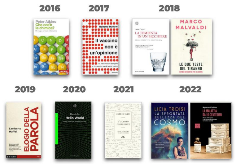
Figure 2 – List of all the winning books in the seven editions of the ASIMOV Prize.

The concluding act of each edition of the ASIMOV Prize consists of a final ceremony in which the awarded students are invited to present and discuss the finalist books. Finally, the author of the book that has scored the highest overall score, as determined by the votes of the Jurors, is declared winner of the ASIMOV Prize by the spokesperson, on behalf of the National Committee and of the Jury. The titles and the authors of the winning books of the seven editions are reported in Fig. 2. Since the first edition, the final ceremony has moved between different locations (except for editions 2020 and 2021, which were held online only due to Covid-19 restrictions).