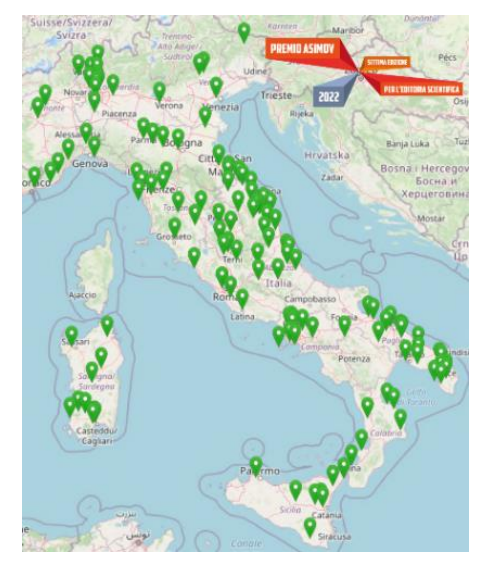
Figure 1 – Distribution of the High Schools in Italy participating in the ASIMOV Prize.