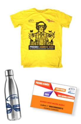
Figure 3 – Examples of gadget for students and teachers participating to the ASIMOV Prize.

In order to encourage a large participation in the ASIMOV Prize, various incentives have been devised for both students and teachers. In particular, students are encouraged to take part in the ASIMOV Prize and read at least one book to obtain school credits and/or recognition of young apprenticeship programs (for a total of 30 hours per book), which in Italy are presently called PCTO ("Percorsi per le Competenze Trasversali e l'Orientamento"), formerly ASL ("Alternanza Scuola Lavoro"), and aim to equip students with useful skills and competences for the purpose of employment. Awarded students win educational trips to one of the organizing bodies, as well as gadgets or bonuses for buying books, as shown in Fig. 3.