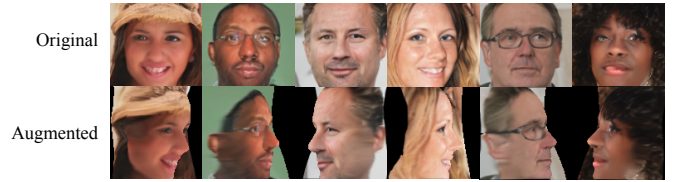
Fig. 1: Sample original and augmented face images from the IDiff-Face (Uniform) dataset obtained by synthetically rotating face pose in the yaw axis used by the BOVIFO CR-UFPR team in task 2.

BiDA-PRA (Task 1 and Task 2): The BiDA-PRA team submitted the same model for both tasks. They used iResNet-