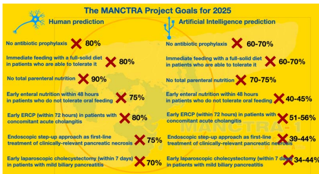
FIGURE 2. The MANCTRA project goals for 2025.

The monitoring of the application of the elements can be carried out considering a benchmark of \geq 50\% for the whole bundle and specific thresholds for every single element. The working group and the panel of experts have also elaborated forecasts on compliance with every single element of the bundle based on the potential for its dissemination and penetration into the clinical care practice (Fig. 2). For each bundle element, the panel of experts performed a literature review to highlight the levels of compliance reported in previous studies. The average compliance rate was taken as a reference, and +10% was applied to the final goal as a likely increase thanks to human effort. Within this context, the forecasts