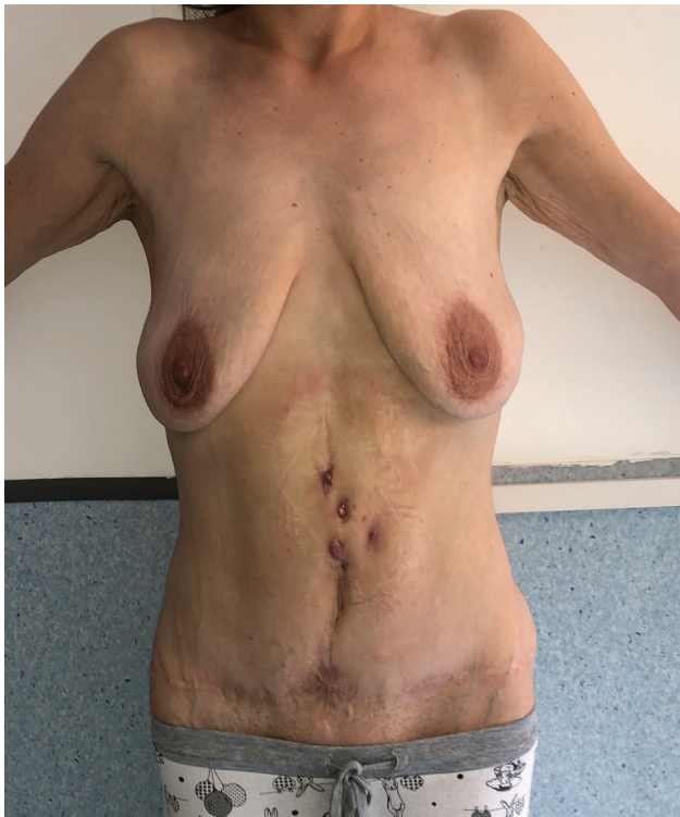
Fig. 2 Reappearance of cutaneous lesions after umbilical hernia repair.