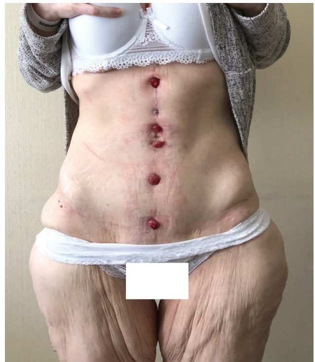
Fig. 4 Multiple granulomas on the midline incision.