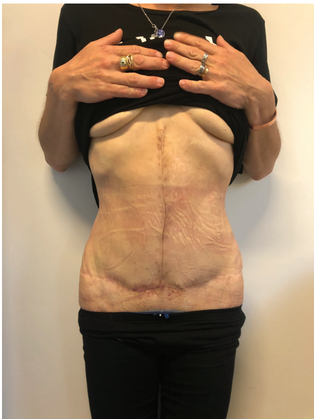
Fig. 3 Final result.