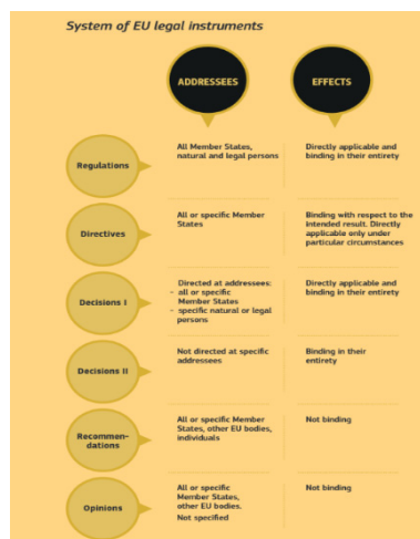
Figure 1. System of EU legal instruments ( The ABC of EU Law , 2018, p. 99)

To begin with, EU regulations are explored as a legal genre with specific features. Fig. 1 below represents all the types of documents and instruments issued by the European Parliament and Council. They include regulations, directives, decisions, recommendations and opinions, as explained by Borchardt in The ABC of EU Law (2018). In particular, the present study deals with regulations which are the most binding documents among the ones selected. They belong to Secondary Law of the EU (Primary Law are the Treaties). They are legal acts of the EU, in the sense that they are equivalent to Acts of Parliament. They are directly applicable and enforceable in all Members States simultaneously and, unlike Directives, they do not need to be transposed into national law by means of implementing measures. They override all national laws dealing with the same subject. What they state is law and this is particularly important for our linguistic analysis of translations. Borchardt's work provides an "initial insight into the structure of the Union and the supporting pillars of the European legal order" ( https://op.europa.eu/en/publication-detail/ ).