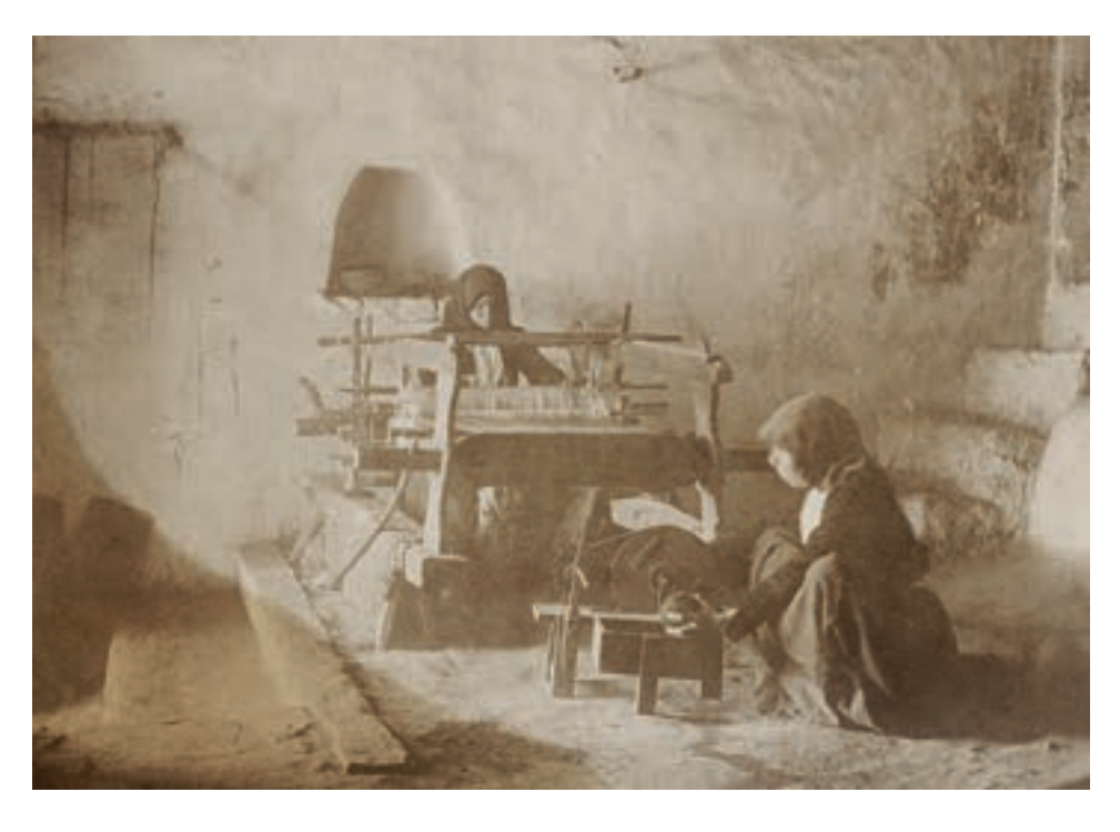
We arrive in Nùoro, photographed as the backdrop of a cultivated field (IMAGE 31).

We then go up to Fonni, where we find images taken indoors, where the grain is being cleaned, but the act is not documented. In Fonni our technological lexicon is also enriched in some way: weaving on a horizontal loom, the preparation of a skein of wool (IMAGE 30).