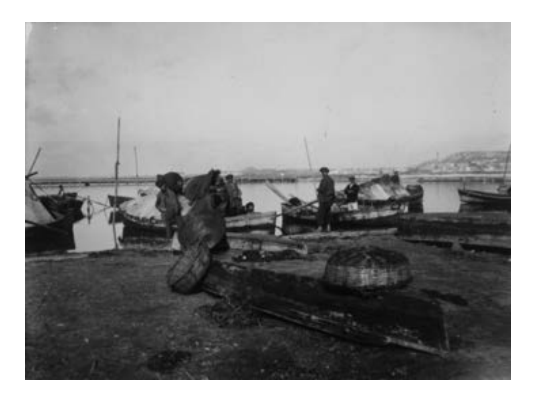
He is struck by the lively atmosphere of the port, with the inevitable piccioccus de crobi portrayed on the quays near Via Roma, playing (IMAGE 6) or posing for the photographer (IMAGE 7).