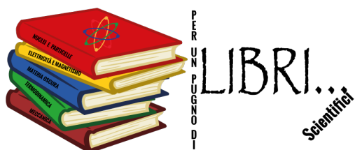
Figure 1. Logo of the project "Per un pugno di libri ... scientifici".