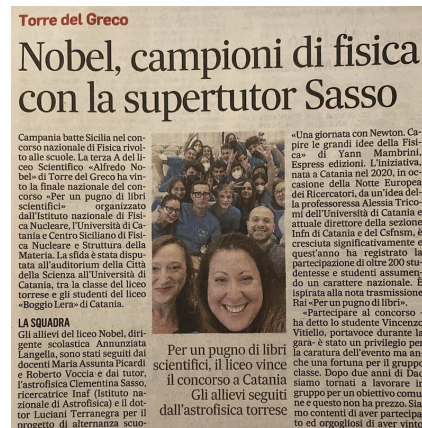
Figure 7. Article reprinted from "Il Mattino", Napoli.

Students taking part in the "Per un Pugno di libri ... scientifici" obtain school credits and recognition of young apprenticeship programs for a total of 25 hours for the local competitions, which in Italy are presently called PCTO ("Percorsi per le Competenze Trasversali e l'Orientamento"), aiming to give students useful competences for employment purpose.