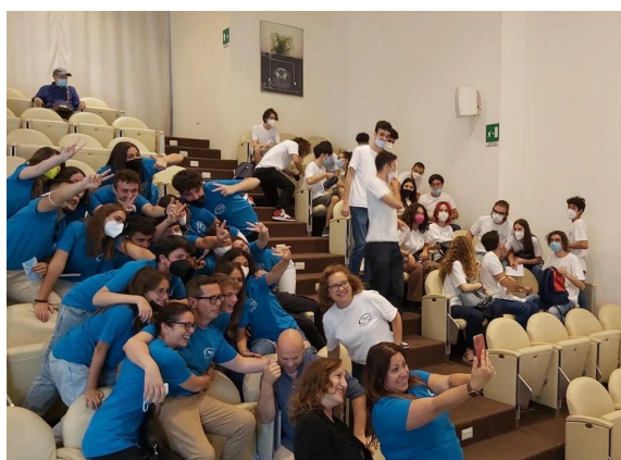
Figure 5. Group photo of students from “E. Boggio Lera” (white shirt) and “A. Nobel” (blu shirt) .

After the regional competitions, we turned to the semifinal and the final competitions. The book chosen for the semifinals and the final was “Una giornata con Newton. Capire le grandi idee della fisica” by Yann Mambriani, published by EsPress [6] (see Fig.4); the author was connected remotely to the audience. The final competition was disputed between Liceo “A. Nobel” from Torre del Greco (NA) and Liceo “E. Boggio Lera” from Catania. The winner, Liceo “A. Nobel”, was awarded by the EsPress publisher with a big box full of books, similarly to the RAI3 show. Fig.5 displays all students after the final competition in Città della Scienza, Catania.