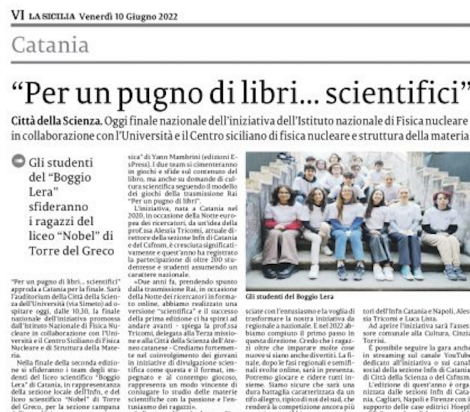
Figure 6. Article reprinted from "La Sicilia", Catania.

It is important to stress the large dimension of the audience remotely connected; in fact, after checking the Youtube channel of our initiative, https://youtu.be/XjJG9q-8AzM , we found about 3000 visualizations. The final event was largely represented in the national and local press. Articles' parts are displayed in Fig.6 and Fig.7, respectively from La Sicilia (Catania, issued on June 10th, 2022), and Il Mattino (Napoli, issued on June 10th, 2022).