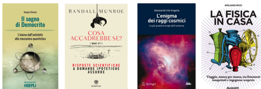
Figure 3. Covers of the books chosen for the regional competitions.

four winners of the regional competitions then competed in two semifinals and a final. More in detail, the book chosen by the INFN-Catania jury for the sicilian schools was “Il Sogno di Democrito” [2] by Giorgio Chinnici; at INFN-Cagliari the local jury chose “Cosa accadrebbe se?” [3] by Randall Munroe; “L’Enigma dei Raggi cosmici” [4] by Alessandro De Angelis was the book chosen by the jury at INFN-Napoli. Finally, the INFN-Firenze jury decided for “La Fisica in Casa” [5] by Emiliano Ricci. Except in Cagliari, the books’ authors were present in all competitions, taking actively part with questions to and from the students, short interviews and games based on scientific culture about physics. The books covers are displayed in Fig.3.