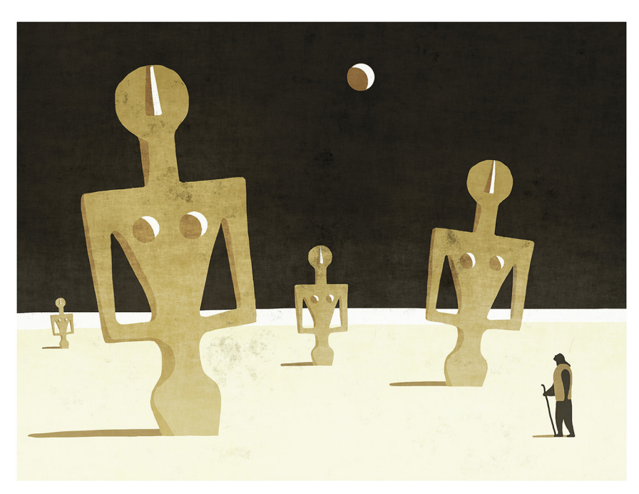
FIGURE 6 Toni Demuro, Untitled (reproduced with permission from Toni Demuro).

amplifies the gaze and involves the external observer in the mining narrative. ^{26}