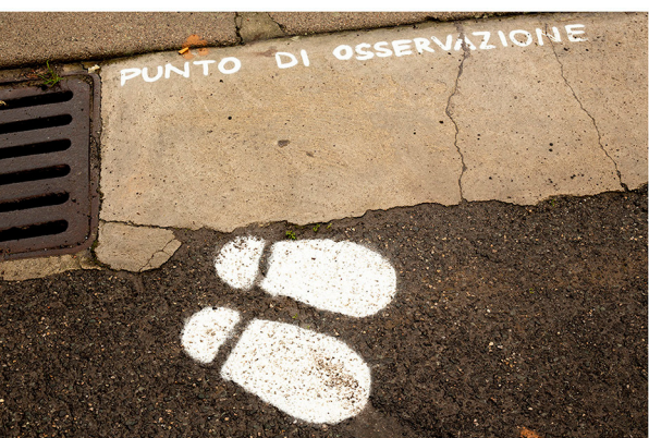
\begin{tabular}{ll} Figure 5 \\ Manu Invisible, \it Territorialità $^{23}$ (reproduced with permission from Manu Invisible) \\ \end{tabular}