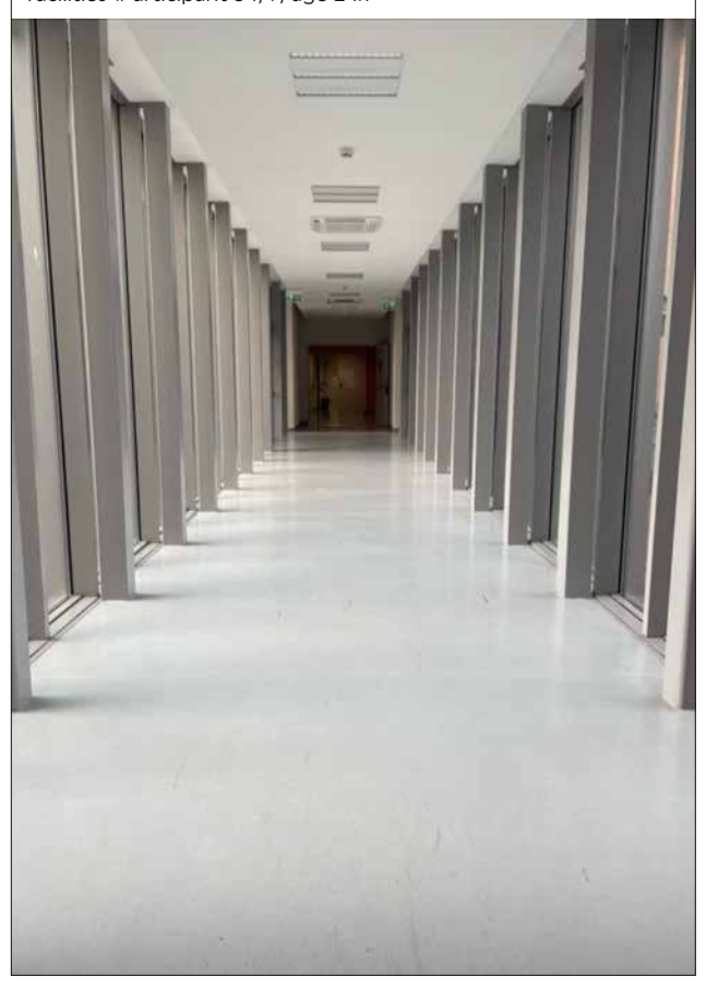
Fig. 2. Example of a perceived lack of accessibility in healthcare facilities (Participant 34, F, age 24).