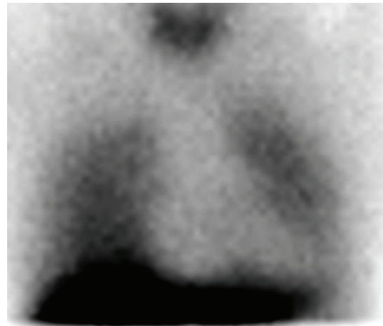
FIGURE 2: SPECT images showing a decreased myocardial ^{123}\text{I} -MIBG uptake in the whole left ventricle.

One month later, the patient underwent a cardiac MRI study which confirmed the complete recovery of the