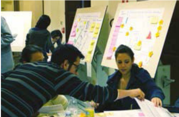
Fig. 4 Scientific Workshop in Vila Nova de Cerveira, Portugal, October 2013.