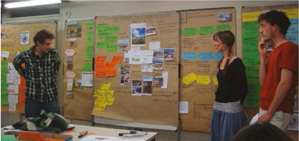
Fig. 6 Scientific Workshop in Grenoble, France, May 2013.

In the scientific workshop in Grenoble, almost 50 students were engaged in different work teams (fig. 6). These students were expected to analyse a contemporary project, after the project's researchers exemplified the procedure with a vernacular example. The final phase of the session consisted in a general presentation, where every team had to explain to all participants how their examples embraced all the operative approach strategies originally presented. The overall understanding led to less questions during the application of the operative approach, and a faster resolution of the outcomes. The quality of the consequent analysis and the exceptional level of the student's satisfaction confirmed the evolution process of the operative approach. The interaction of such methods contributed significantly to the quality of the project outcomes, proving that it is possible to overcome the generic prejudice of engaging Research and Development activities within the external community, and to obtain explicit benefits for every evolved part.