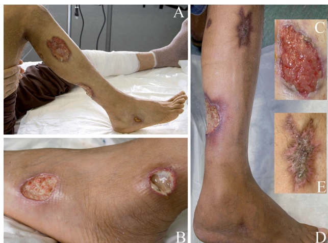
Fig. 1. (A) Typical lesions of pyoderma gangrenosum over the right leg and calf on admission prior to infliximab treatment. (B) Lesions on admission: left ankle and foot. (C) Left knee lesion after 3 months. (D) Lesions after 5 months: right limb. (E) Antero-lateral tibial area: after 12 months.

As reported recently, the overproduction of TNF- \alpha plays an important role in neutrophilic dermatoses (14). TNF- \alpha is a pro-inflammatory cytokine that acts as a pivotal regulator of other cytokines, including IL-1 \beta , IL-6 and IL-8, which are involved in inflammation, acute-phase response induction and chemotaxis. In accordance with other authors (7, 15), we demonstrate here that increased serum levels of TNF- \alpha and IL-6 can also be found in the idiopathic form of PG and were normalized after starting treatment with infliximab (Fig. 2). We chose to initiate infliximab therapy with an induction course (5 mg/kg at weeks 0, 2 and 6), taking into account the observations of Adisen et al. (10).