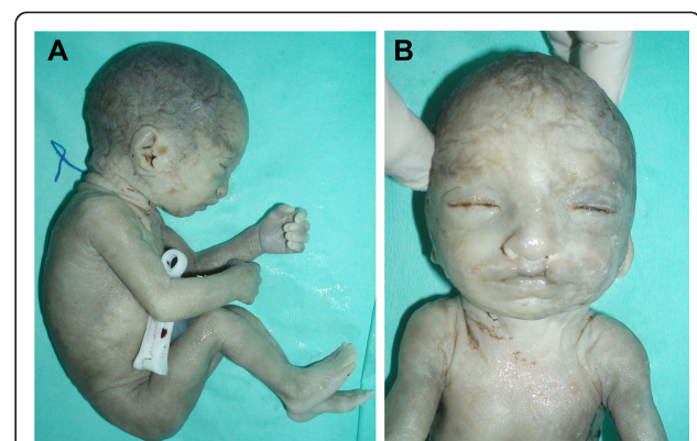
Figure 1 Autopsy of a 24 weeks' gestation female fetus after pregnancy termination (Case 2) that showed external features of facial dysmorphism with bilateral cleft lip, hypertelorism, broad and high nasal bridge, small filter and large ears.

Amniotic fluid was collected from case 1 and case 2 at 23 weeks of gestation. Cytogenetic analysis was performed on cultured amniocytes by G-banding according to standard procedures. At least 20 metaphases were analyzed per case, revealing a male karyotype with terminal deletion of the short arm of one of chromosome 4 [46, XY, del(4)(p15.33)] in case 1, and a female karyotype with terminal deletion of the short arm of one of chromosome 4 [46, XY, del(4)(p15.31)] in case 2. a-CGH was done on DNA from cultured amniocytes to characterize the extent of the deletions using a 100 kb resolution array (kit 44 K) in case 1 and a 40 kb resolution (kit 180 K) in case 2. Molecular karyotyping was carried out through oligonucleotide array-CGH platforms (Agilent Technologies, Santa Clara, CA) as described elsewhere [9].