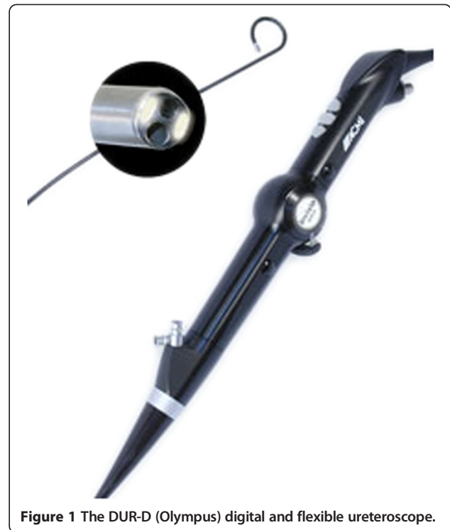
Figure 1 The DUR-D (Olympus) digital and flexible ureteroscope.

Deflection capability is also an important issue. The Storz FlexX2 Wolf Viper allows a 270° deflection in both directions, while the Olympus P5 allows 270° in one direction and 180° in the other. The DUR 8-elite ureteroscope (ACMI) was the first to offer dual primary and secondary active tip deflection that totals 270°. Preliminary reports suggest that secondary deflection is necessary in approximately 20–29% of cases [102-104], particularly with regard to lower pole access. Although expensive, the holmium: YAG laser is actually the best