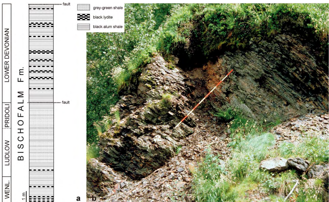
Views of the Graptolithengraben Section. a) lithostratigraphic column of the section (redrawn from FLÜGEL et al., 1977 and SCHÖNLAUB, 1985); b) close view of the Bischofalm Formation exposed in the Graptolithengraben Section. Note that the section is reversed.