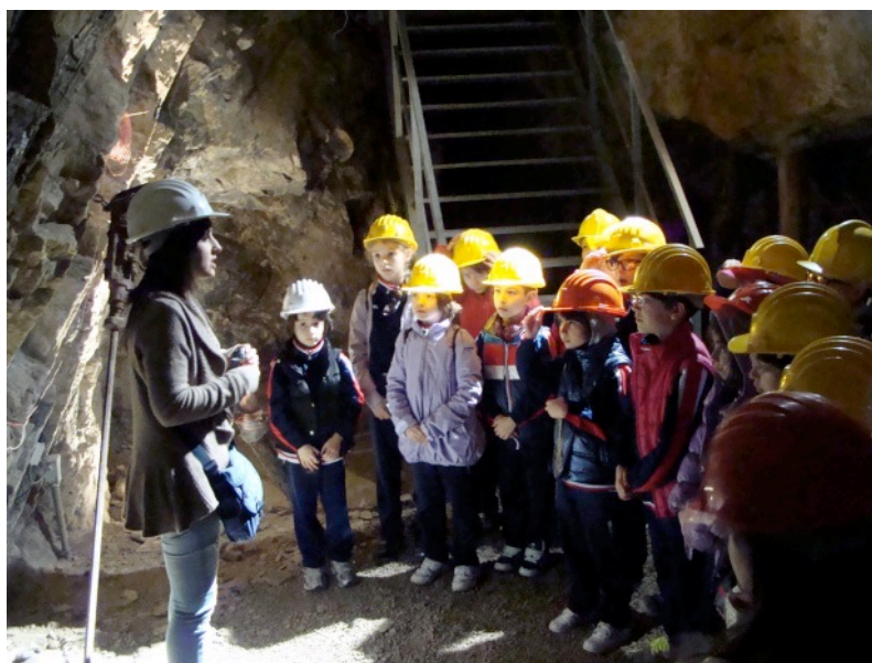
Figure 4: Visitors at the Rosas' mine shaft