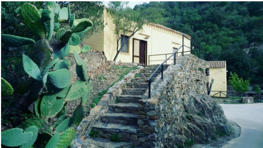
Figure 6: One of the buildings of the hotel