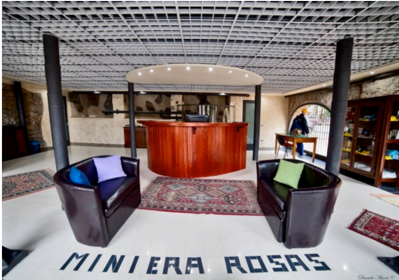
Figure 5: The reception of the Rosas Mine’s “albergo diffuso”