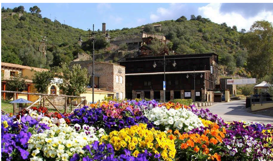
Figure 2: The Rosas Mine village today