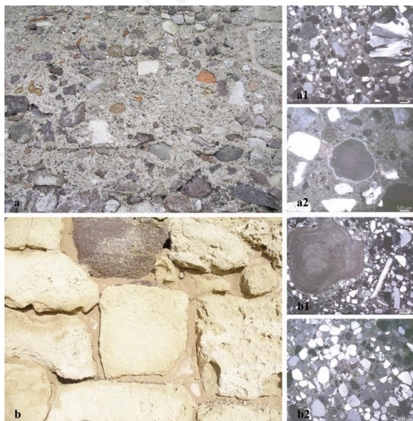
Figure 6. Plaster of the north prospectus (a) and mortar of the south façade (b). a1, a2) Thin section photomicrographs (crossed polarizer) of plaster with grained quartz-feldspar, volcanic and quartzite aggregates. The binder is micritic with cryptocrystalline reaction rims around mineral grains. b1-b2) Thin section photomicrographs (crossed polarizer) of mortar with grained quartz-feldspar and very poor volcanic and quartzite aggregates. The binder is micritic with lime lumps.