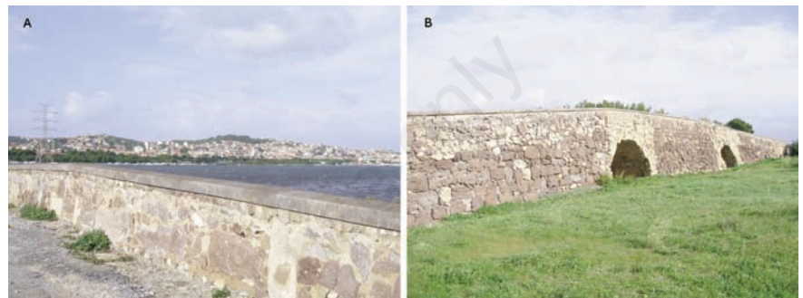
Figure 1. View of Sant'Antioco town from the bridge (A) and detail of the south front (B).

In short, the current state of deterioration, on one hand is due to adverse conditions and to the prolonged lack of maintenance – as we will see after, talking about Materials and the