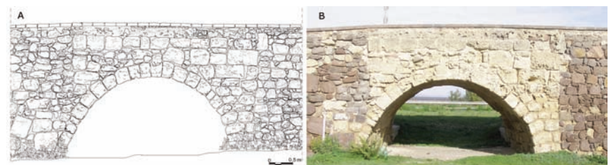
Figure 3. Drawing (A) and picture (B) of one of the arches of the south prospectus (drawing by courtesy of V. Pintus and M. Porcu). It shows an advanced degradation, with the presence of alveolisation, pulverisation and pitting processes.