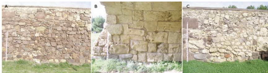
Figure 4. Sequence of the masonries concerning the south façade: A) part near the first arches towards west; B) detail of the interior of one of the arches; C) the terminal part towards east.

The plaster contains coarse grains; in the north façade the aggregates are poor assorted, while those in the south are well assorted. In