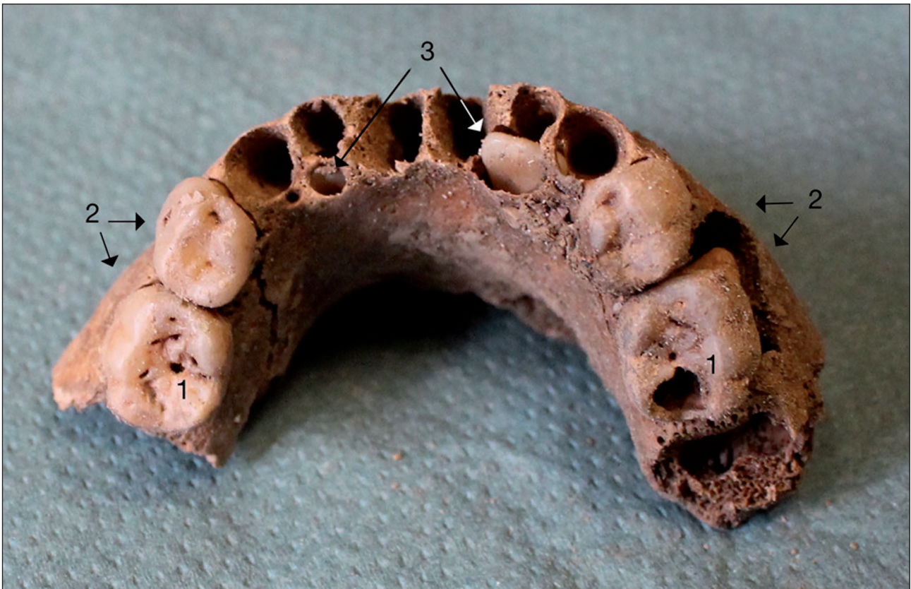
Figure 2. Jaw from the ancient sample group, comprising 6- to 8-year-old jaws. 1) caries, 2) deciduous teeth, 3) permanent teeth, in eruption.