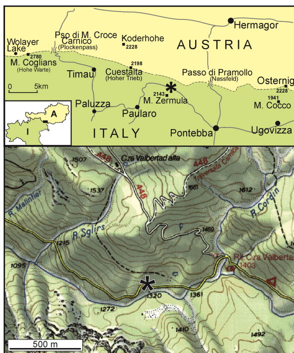
Figure 1. Location map of the Valbertad section.

The Valbertad section can be reached from Passo del Cason di Lanza moving for about 3 km along the road to Paularo. It is located north of the road at altitude 1325 m a few hundred meters west of the place where stood the old Casera Valbertad Bassa (Fig. 1).