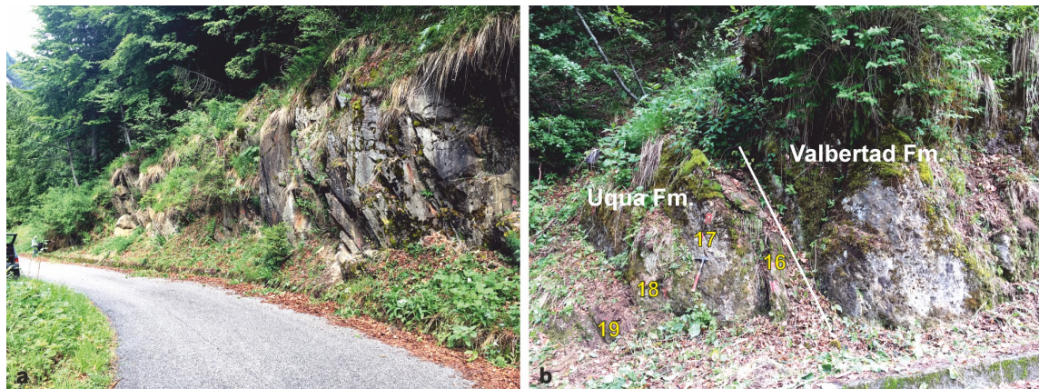
Figure 2. Views of the Valbertad section. A. Panoramic view from the base of the section. B. Detail of the upper part.