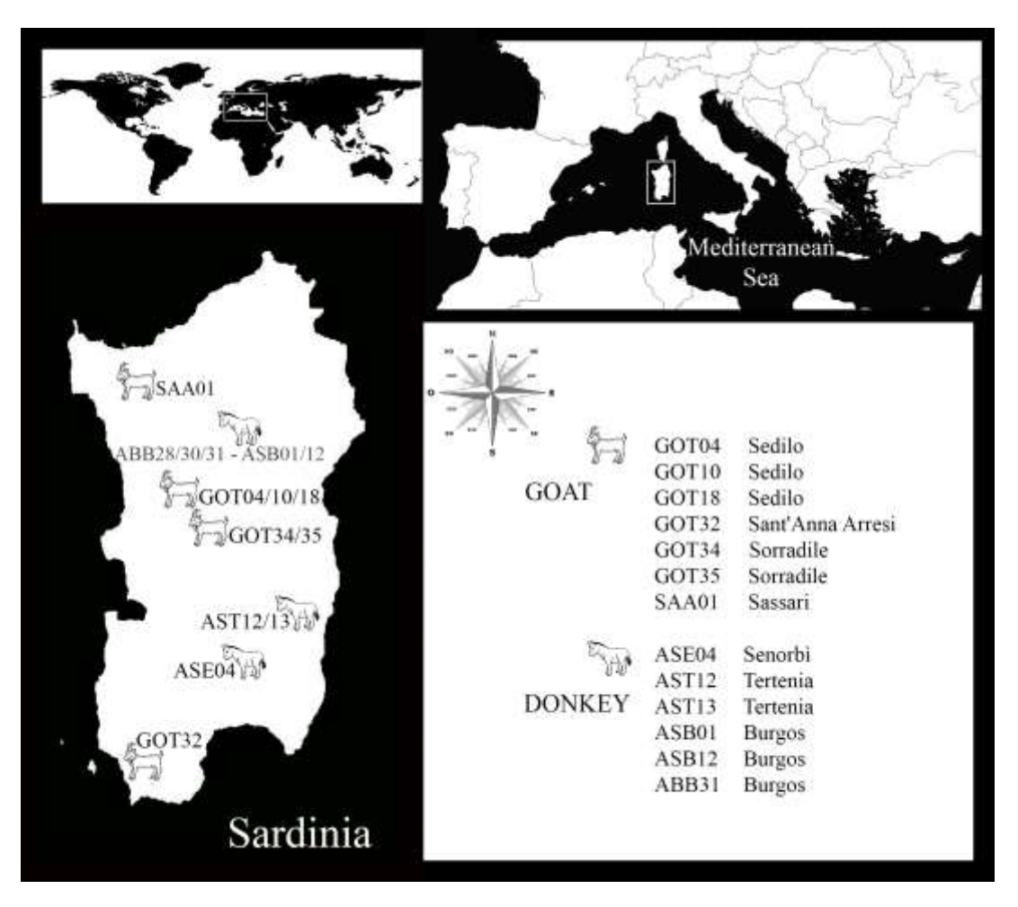
Figure 1. Sampling locations of Capra hircus and Equus asinus . The sampling site of each specimen is reported. For further details see Table 1.

peaks in donkeys (31 of which for UBC864 and 48 for UBC868). Private bands were detected both in goats and donkeys, and interestingly, the donkey AST12 shows four private bands.