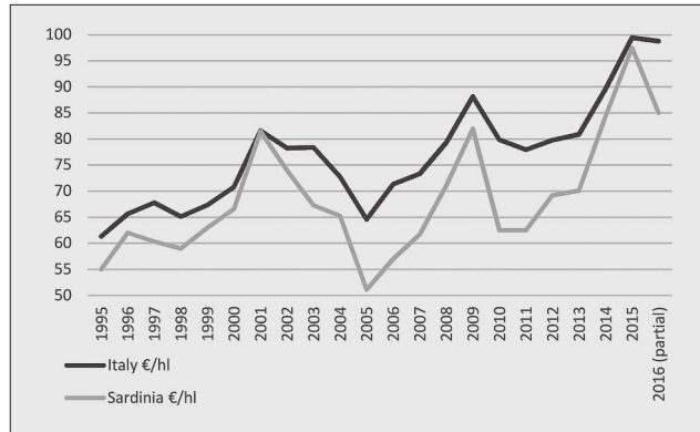
Figure 2 Volatile performance of the price of sheep's milk in Sardinia

where tourism is not the prevailing economic activity. Through diverse activities including food fairs, brand names, designation of PDO/PGI products, farms and manufacturing businesses available for tours, and the protection of indigenous flora and fauna, all actors are organized around these territorial resources and aim at development collectively. These actions are supplemented by other measures and funding tools at the regional level including RIS3 actions for smart specialization.