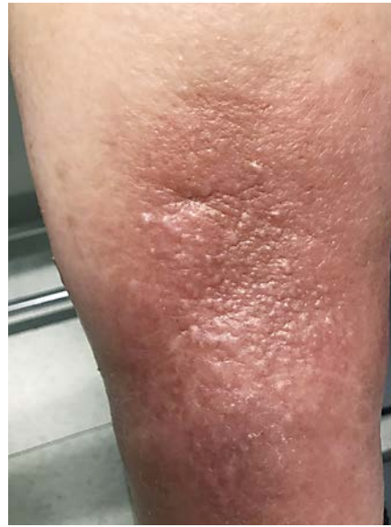
Fig. 1. Patient 1: translucent erythematous, skin-colored papulo-nodular lesions on the shins of edematous legs.