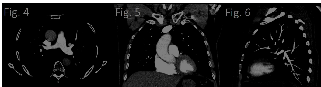
Figures 4-6: Angio-CT radiological control after 96 h: The absence of the previous findings in axial (Figure 4), coronal (Figure 5) and sagittal (Figure 6) sections indicate a complete resolution of the thromboembolic event.