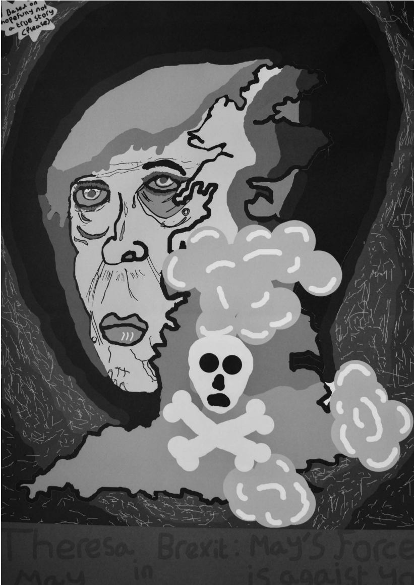
Figure 12.5 May's force is against you

A similarly unambiguous position emerges from Figure 12.5. The drawing symbolises the same traumatic experience and ‘here and now’ approach to Brexit