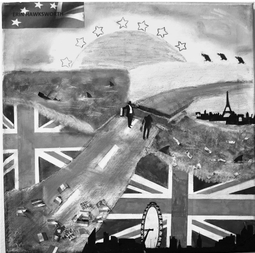
Figure 12.2 As we leave the EU