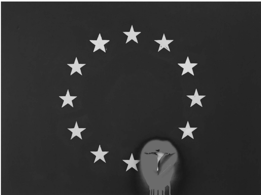
Figure 12.1 Bloodshot

Among the most commonly recurring feelings was a sense of traumatic shock (Seidler, 2018). Figure 12.1 depicts Brexit as a painted European Union flag with a bleeding hole punched through the canvas, replacing one of the stars symbolising the Union. Interestingly, it is not a British flag that is bleeding. This suggests that