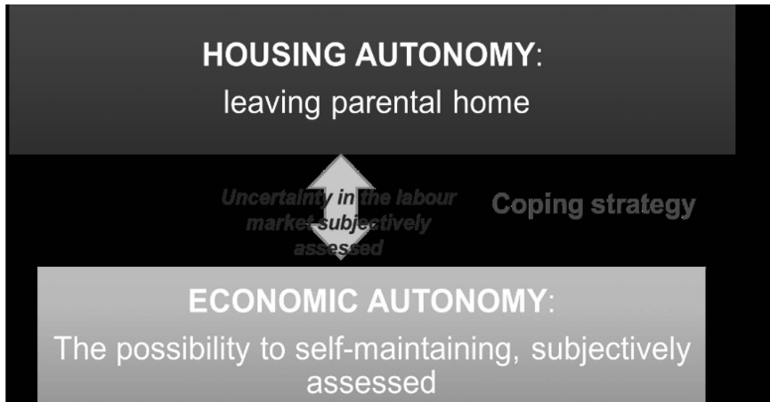
Figure 5.1 Conceptual map