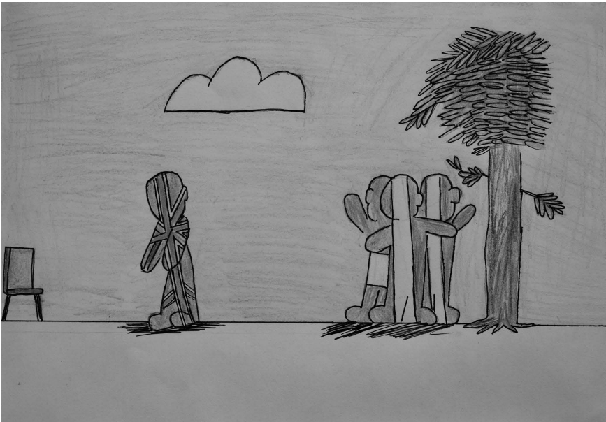
Figure 12.6 Conversation expectation

I am going to make a painting showing people wearing flags of their nation . . . and we will have a sad face . . . I feel that this will show how we will be left out of the group of friends, and I am concerned how that will feel. I am worried we may become isolated. It is like being left out of a group of friends you have had for a while.