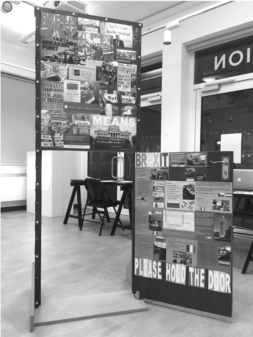
Figure 12.4 Please hold the door