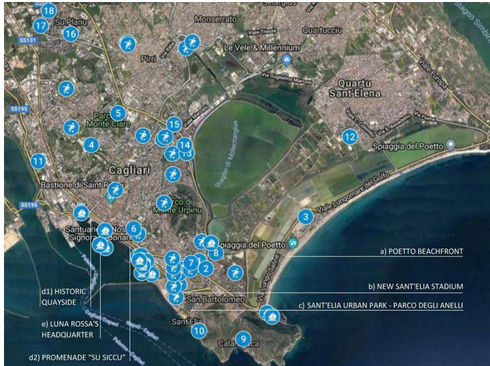
Fig. 1 Cagliari street sport: land and water. The system of sports facilities in Cagliari and the main strategic projects - completed, under construction or planned -.

In addition to these operations, in recent years the Municipality has organized or endorsed several sports events such as AteneiKa , Cagliari respire and SoloWomenRun which are progressively involved more and more people (Comune di Cagliari, Dossier candidatura Città Europea dello Sport, 2017). The significant program of material and immaterial actions carried out has been recently confirmed by the Il Sole 24 Ore survey - Sportiness index 2018 , referred to the 107 Italian provinces, where Cagliari has reached the third place in the top 20 ranking.