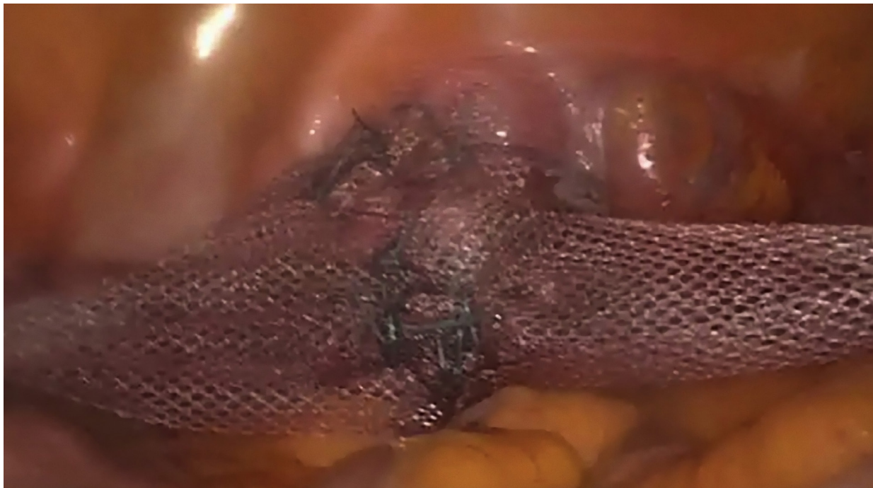
Figure 2: Mesh lateral suspension.

Descriptive analyses included the calculation of observed frequencies (percentages) for each categorical variable, while means and standard