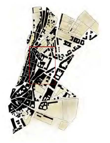
1943: Factories and residences that took the place of open fields, are damaged by the bombing

1850-1900: Dismissal of the city walls and urban development along the main roads