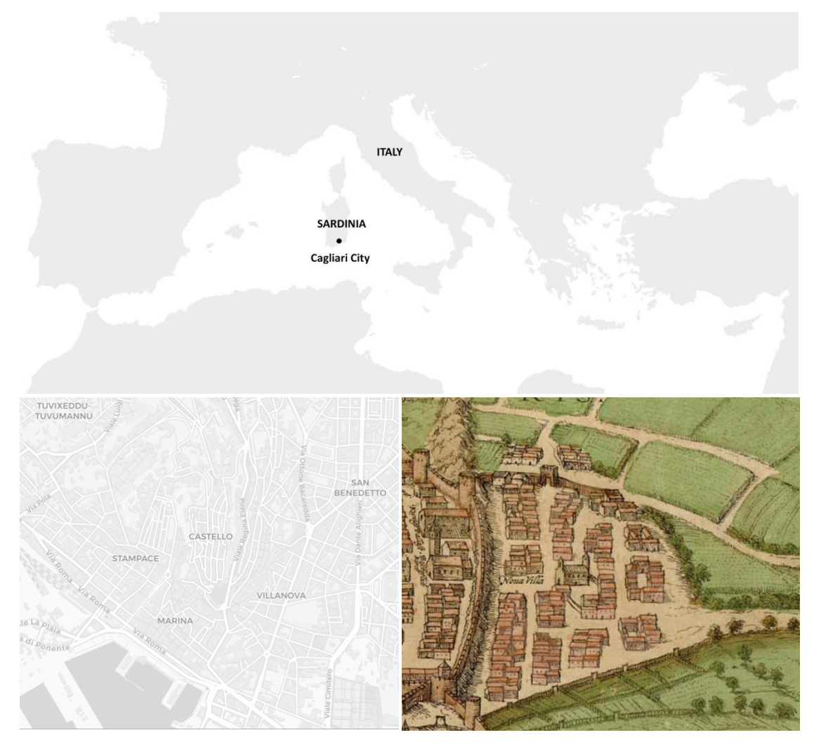
Figure 1: Cagliari City - the geographical context, a view of the city centre and a view of Villanova District in the Cosmographia Universalis by Sebastian Münster (1550)

To sum up, the renovation interventions modified the historic identity of Villanova, leading to a "hybrid" district, where residents, new inhabitants and migrants, luxury boutiques and old shops coexist with some conflicts. This is an example of incomplete or still ongoing gentrification and, therefore, it may help study the role played by architects and planners for the creative and cultural transformation of the historical buildings, unlike the other historic districts of Cagliari. For this reason, Villanova has been chosen as a case study for this research.