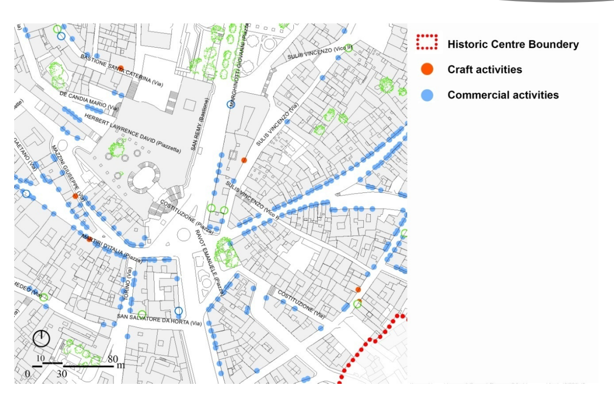
Figure 4: Map of the commercial businesses as of 2015 in the Detailed Plan for the City Centre. Considering the business locations, the map shows a different picture of Via Sulis compared to Figure 3

Other "relevant" factors are the proximity to public transport services for accessibility purposes and the average monthly rent in relation to the environmental context. The average rent per square meter was directly assessed, where possible. In the other cases, it was calculated as follows: (n workstations x monthly fee in \in per workstation) / (Surface covered by the coworking workstations in % x total surface of the site). In this regard, the average monthly rent per square meter for coworking premises compared to the one for the most similar building type in the homogeneous territorial area (OMI area) in the 2<sup>nd</sup> half of 2018 was: