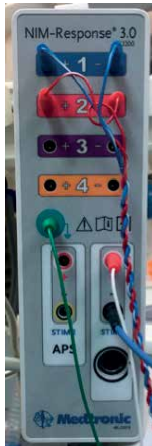
Figure 3. Stimulation and recording sides are combined on the interconnect box, through which they connect to the monitor.

recording side, instead, consists of the ET tube with surface electrodes, which are placed at the level of the vocal cord, and their ground electrode ( Figure 2 ). These two main systems combine on the interconnection box ( Figure 3 ), through which