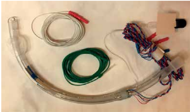
Figure 2. ET tube with surface electrodes and grounding electrodes (white: stimulation side, green: recording side).