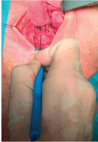
Figure 5. RLN stimulation at the end of thyroid dissection and complete hemostasis (R2).

In 2011, the International Neural Monitoring Study Group (INMSG) defined the standard stages of intraoperative neuromonitoring in thyroid surgery by adding preoperative and postoperative vocal cord examinations to the four-step method previously proposed by Chiang et al. [12, 21]. The six stages can be summarized as follows: