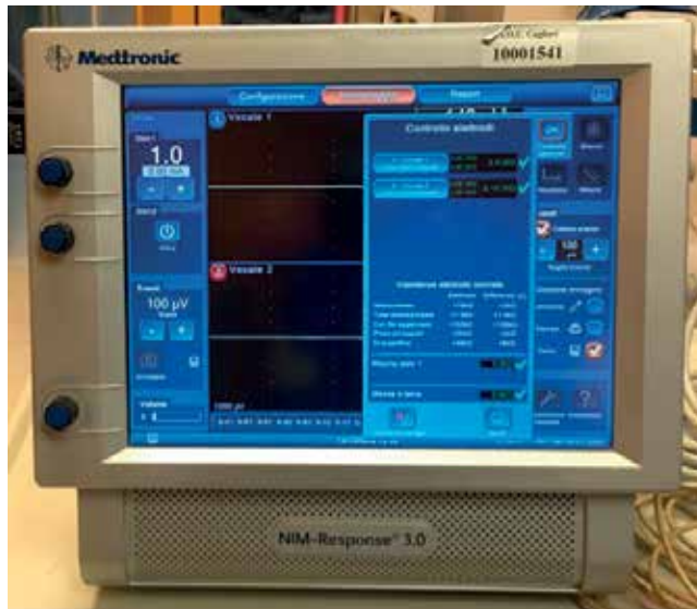
Figure 4. Check of the impedance value of the electrodes from the monitor.

tests to verify the correct location of the ET tube include the evaluation of respiratory changes or a further laryngoscopy. About the first method, in the short-term window period between the loss of the effect of short-acting NMBA and the deepening of anesthesia following intubation, spontaneous respiratory movements should result in waveforms with an amplitude of 30–70 \mu\text{V} on the monitor. These respiratory changes should be detected for both vocal cords.