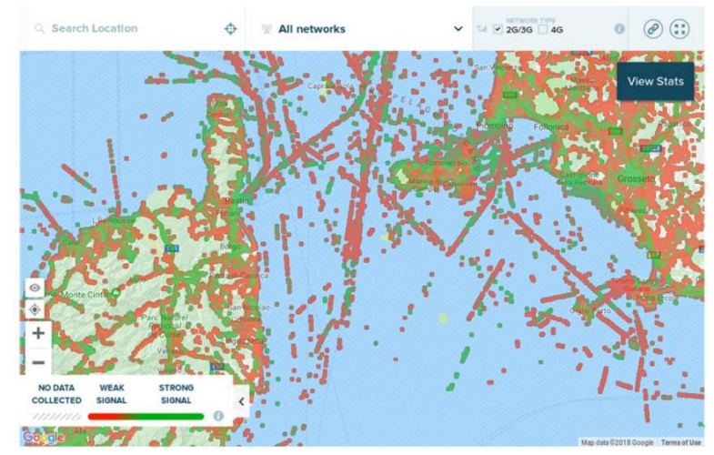
Figure 3. Map of the GSM 2G/3G signal intensity in the Corsica Channel.

using a tracking device based on a global positioning system, such as, among others, NAVSTAR GPS, GLONASS, BeiDou, or Galileo. However, these types of devices cannot be used for standard containers because, in order to avoid damage during handling, they need to be installed inside the unit while their receiving antenna must necessarily be positioned outside. Conversely, these tracking devices are the best option for trailers, as they can be easily installed both in the front area (just behind the tractor) or in the lower side, attached to the metal structure.