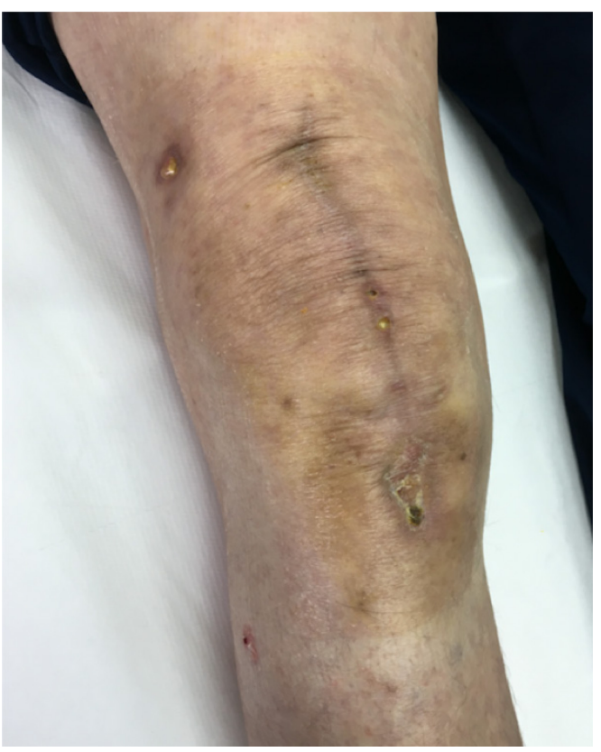
The image shows the operated knee, with a healing wound and two fistulae.