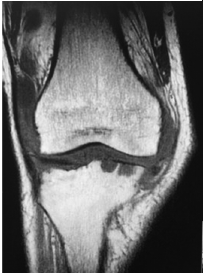
Preoperative MRI of the knee shows subchondral bone erosion of the medial compartment.

Figure 1. MRI of the knee, coronal view, T1-weighted scan.