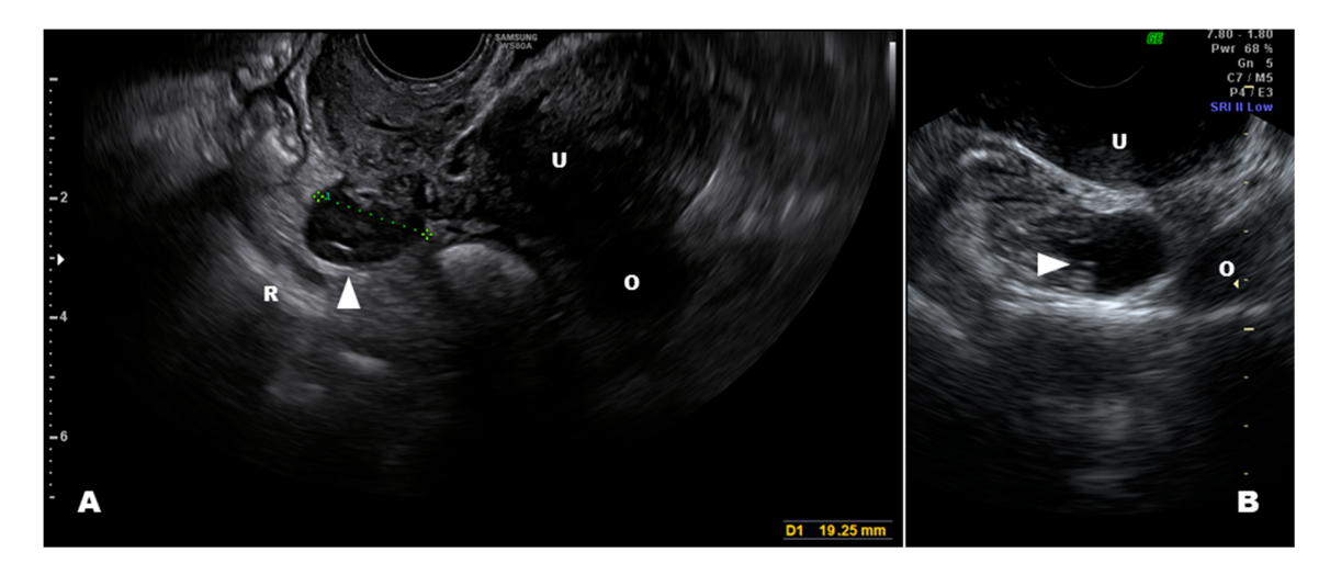
Figure 3. Cystic endometriosis (arrow) of the retroperitoneum in two patients on medical therapy with previous pelvic surgery for endometriosis. ( A ) shows an endometriosis cyst of the rectovaginal septum and ( B ) shows a cyst of the mesometrium. Abbreviations: U, uterus; R, rectum; O, Ovary.

Figure 2. Bifocal endometriosis of the bladder (arrow). The two lesions present different characteristics as the one on the right-hand side presents a typical solid aspect while the left one is a cystic endometriosis location. Abbreviations: B, bladder; C, cervix; U, uterus.