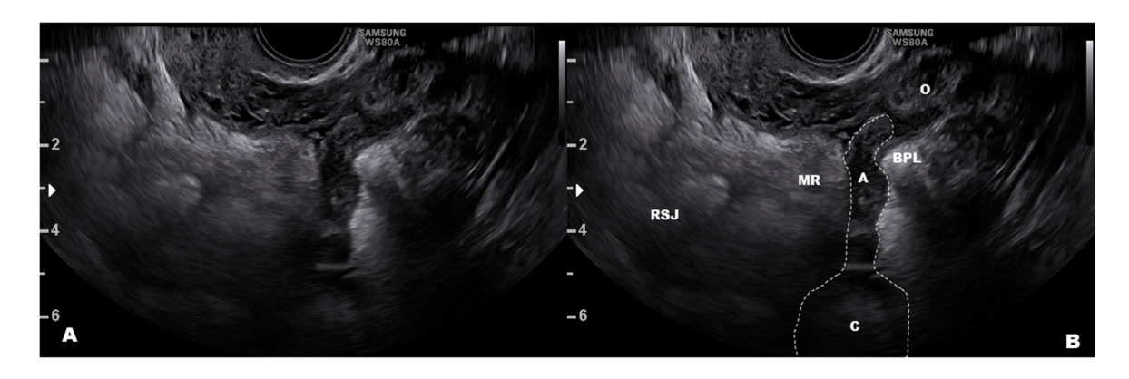
Figure 4. Appendix dislocated downward and attached to the ovary that may mimic mesorectal endometriosis. ( A , B ) show the clean and the labelled image. Abbreviations: A, appendix; O, Ovary; BPL, broad posterior ligament; C, caecum; MR, mesorectum; RSJ, rectosigmoid junction.

both high sensitivity and specificity [46,52]. Additionally, its accuracy is as high as other imaging techniques, such as magnetic resonance, rectal endoscopy sonography, and double contrast barium enema [11,12,15,53]. Bowel lesions can present as different shapes; however, they exhibit an anechoic appearance without posterior enhancement, they can invade the bowel lumen, and they can have digitiform, irregular, or smooth limits. The sliding sign with the uterus and near organs is often negative because the nodule may involve the Douglas pouch or the uterosacral ligaments, or it can be attached to the posterior wall of the uterus.