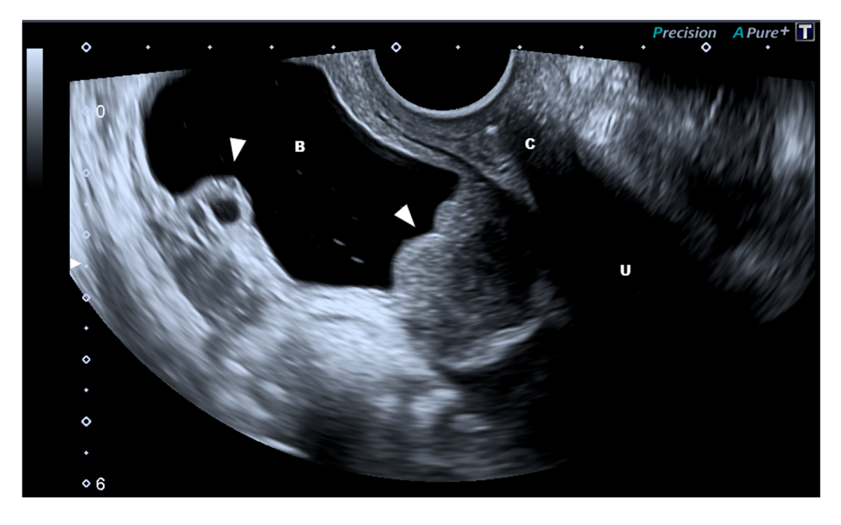
Figure 2. Bifocal endometriosis of the bladder (arrow). The two lesions present different characteristics as the one on the right-hand side presents a typical solid aspect while the left one is a cystic endometriosis location. Abbreviations: B, bladder; C, cervix; U, uterus.