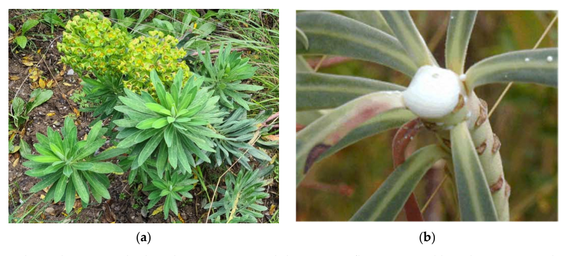
Figure 1. The Mediterranean shrub E. characias . Leaves and characteristic flowers are visible in the imagine on the left (a), while (b) clearly shows the milky latex that exudes from the cut branch of the plant (imagine modified from reference [4]).

E. characias latex has been extensively studied and several proteins have been isolated and characterized. Among them, an enzyme named Euphorbia latex peroxidase (ELP) has been the object of numerous research papers due to its peculiar characteristics. This is a calmodulin-binding protein and its activity is therefore finely regulated by calcium ions. The presence of these ions, in addition to increasing the enzymatic activity, can even direct ELP towards different catalytic pathways using the same substrate [5]. A copper/TPQ-containing amine oxidase is also a part of the complex machinery of E. characias latex and the characterization of this enzyme made it possible to discover the key role of specific amino acids and domains in modulating substrate access into the active site of plant and mammalian amine oxidases [6]. Moreover, other enzymes have been purified and characterized and several nucleotide sequences are present in the GenBank database [7–9].