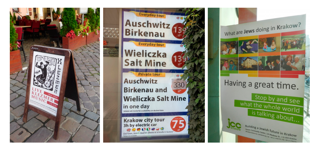
Figure 2. Different representations and aspects of Jewish heritage in Krakow.

Besides the observations and the interviews, the Jewish-themed commercial and cultural offer displayed and promoted through brochures and websites confirmed the coexistence of different and diverging approaches, but also a relatively low level of conflict, as if these alternative paths, a more staged, simplified, and standardized one, and a more alternative, meditative, and immersive one, were clearly available and recognizable for local as well as international consumers. Figure 2 shows some examples: continuous Jewish-style music performed in Jewish-style restaurants, none of which played or run by Jews; fast excursions to Auschwitz and other Jewish-related sites; self-representation by the Jewish Community Center focusing on present-day social and cultural activities.