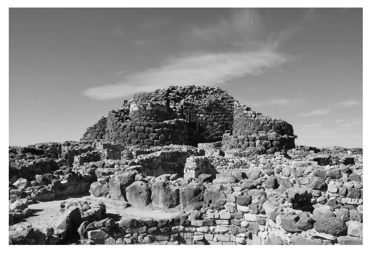
Fig. 8: Nuraghe Su Nuraxi at Barumini (Photo by R. Cicilloni, 2014: Photographic Archive of the Department of Humanities, Languages and Cultural Heritage - University of Cagliari).