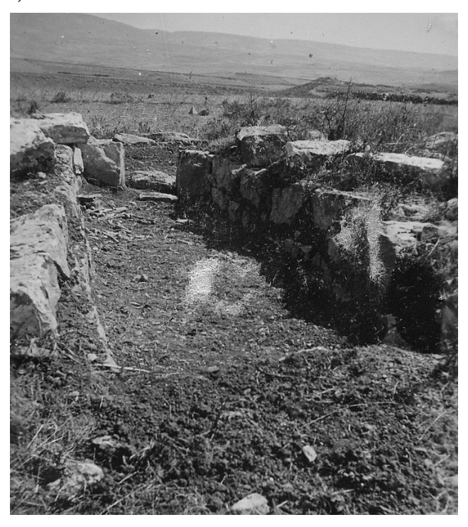
Fig. 6: Giant's Tomb of Pranu at Las Plassas (Photo by G. Lilliu, 1938: Photographic Archive of the Department of Humanities, Languages and Cultural Heritage - University of Cagliari).