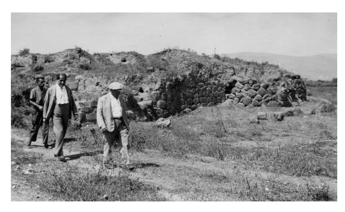
Fig. 7: Nuraghe S'Uraki at San Vero Milis (Photo by G. Lilliu, 1954: Photographic Archive of the Department of Humanities, Languages and Cultural Heritage - University of Cagliari).