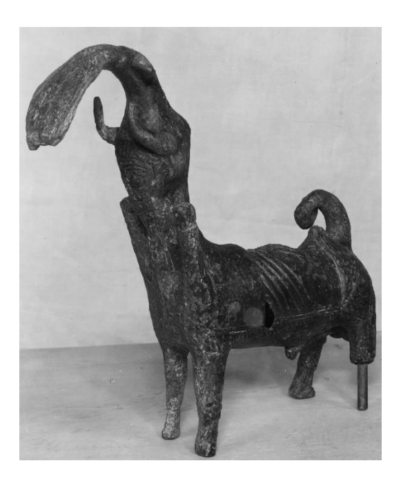
Fig. 3: Nuragic bronze statuette of bull with human head (demon?), from Santu Lisei at Nule (Photo by G. Lilliu, 1956: Photographic Archive of the Department of Humanities, Languages and Cultural Heritage - University of Cagliari).