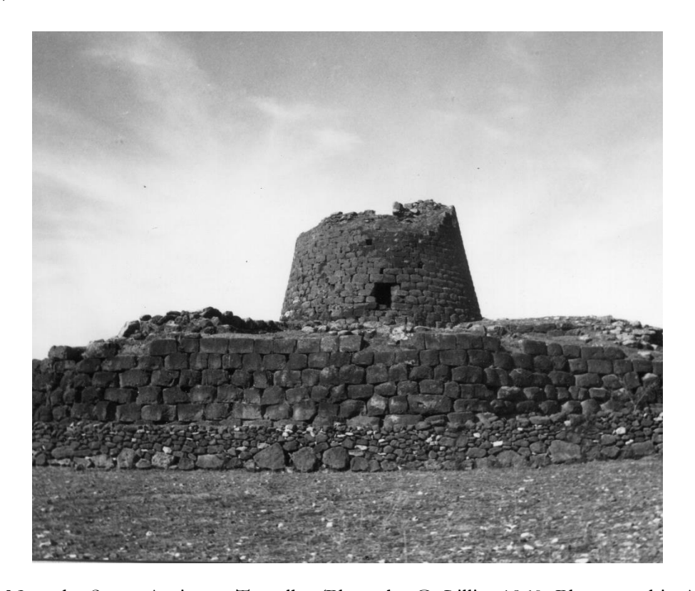
Fig. 1: Nuraghe Santu Antine at Torralba (Photo by G. Lilliu, 1960: Photographic Archive of the Department of Humanities, Languages and Cultural Heritage - University of Cagliari).