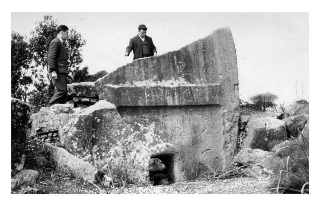
Fig. 9: Giant's Tomb of Goronna at Paulilatino (Photo by A. Corrias, 1960: Photographic Archive of the Department of Humanities, Languages and Cultural Heritage - University of Cagliari).