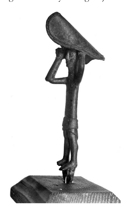
Fig. 4: Nuragic bronze statuette of "boxer", from Cala Gonone at Dorgali (Photo by G. Lilliu, 1956: Photographic Archive of the Department of Humanities, Languages and Cultural Heritage - University of Cagliari).