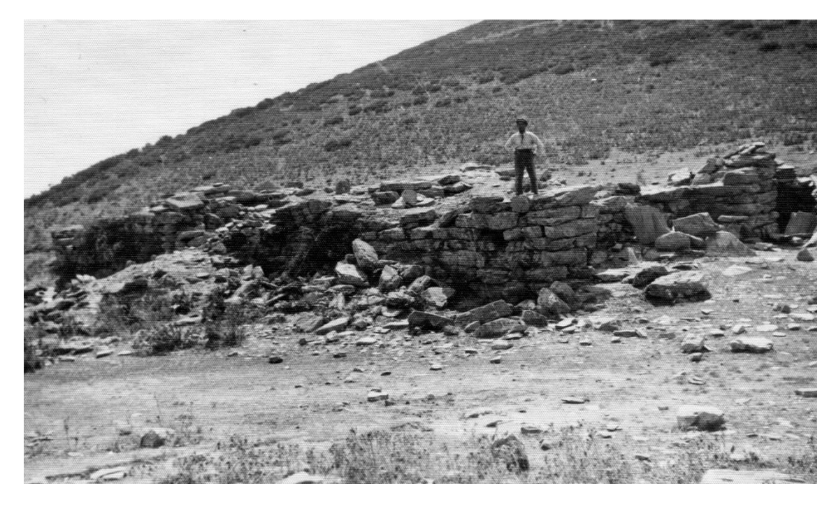
Fig. 10: Temple "in antis" of Cuccureddì at Esterzili (Photo by E. Contu, 1947: Photographic Archive of the Department of Humanities, Languages and Cultural Heritage - University of Cagliari).