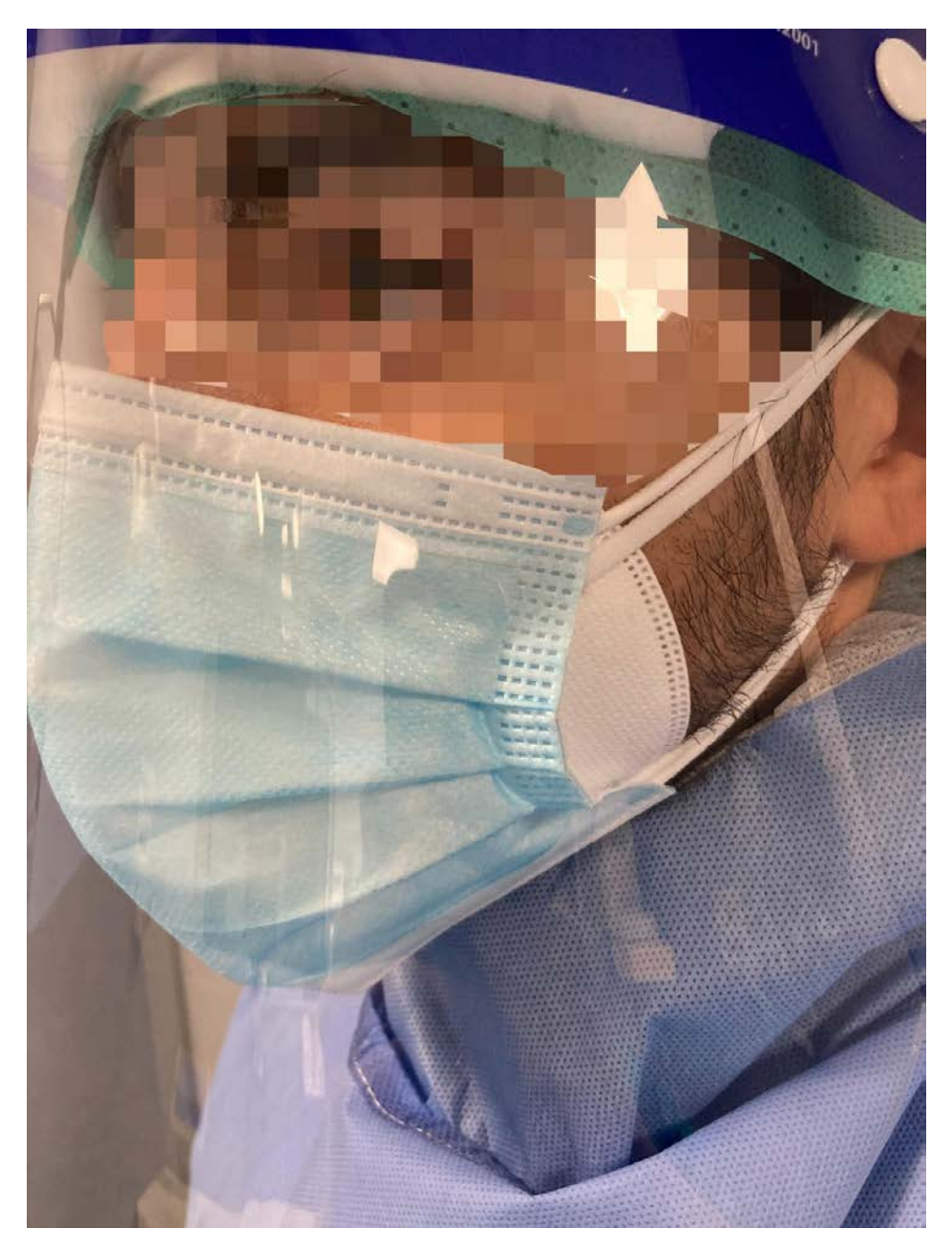
Fig. 2. Focus on face masks that we usually use during our angiographic procedures on COVID-19 positive patients.