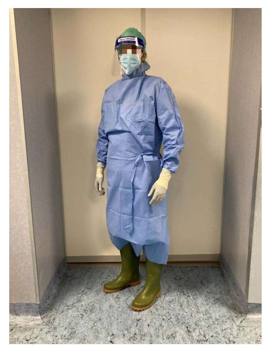
Fig.1. Interventional radiologist equipped with personal protective equiment