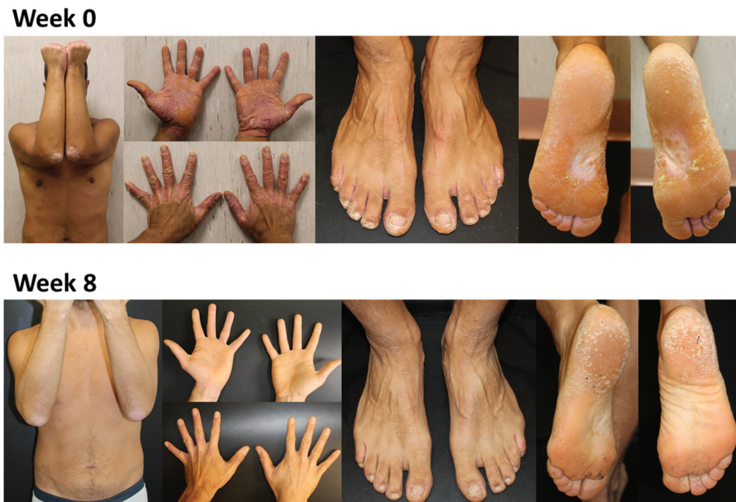
Figure 2. Changes in psoriasis skin lesions during treatment with secukinumab: case 1.

In Case 2, a 67 years old male patient, the onset of palmoplantar was in 2011 and was associated with the grief for the loss of a family member. Disease remission was achieved with topical treatment, but in January 2019 the disease relapsed. Since 2010, the patient had been affected by hypertension and diabetes and had been in treatment for these comorbidities. Relapsing palmoplantar psoriasis was treated with topical agents (corticosteroids, vitamin D-derivatives, keratolytics) and with systemic therapies (acitretin, 20 mg). Acitretin was initially effective but had to be discontinued due to severe hypertriglyceridemia. In October 2019, the patient presented with a ppPASI of 40 and initiated treatment with secukinumab 300 mg. Improvement of ppPASI was slow but continuous and substantial (ppPASI at 12 weeks, 30; at 24 weeks, 18; at 52 weeks, 6) (Figure 3).