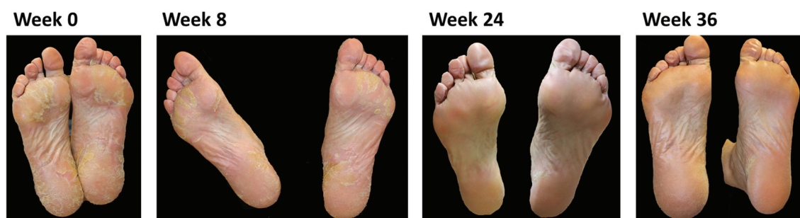
Figure 4. Changes in psoriasis skin lesions during treatment with secukinumab: case 3.

The patient of Case 5, a 65 years old man, was a smoker and had concomitant hypertension and dyslipidemia. The onset of psoriasis was at the age of 63 years, with a predominantly plantar involvement. The patient had been previously treated with cyclosporine A. At treatment beginning with secukinumab, PASI and ppPASI were, respectively, 45 and