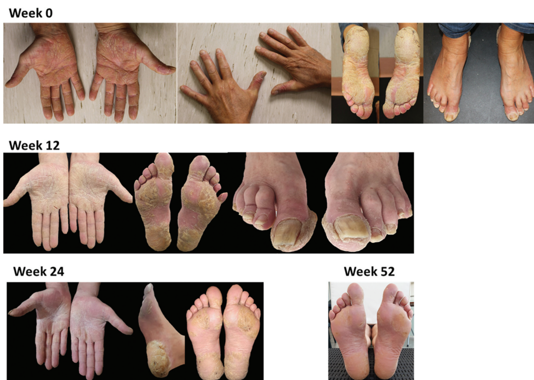
Figure 3. Changes in psoriasis skin lesions during treatment with secukinumab: case 2.

The onset of palmoplantar psoriasis in Case 3, a 69 years old man, was in 2017 and similar to Case 2 it appeared to be related to the loss of a family member. The disease involved only the soles of the feet. The patient, a former smoker, had a 20-year history of diabetes and hypertension and in 2017 had undergone a percutaneous coronary intervention. At presentation he was in treatment for his diabetes and cardiovascular conditions. Palmoplantar psoriasis had been treated initially with topical corticosteroids, vitamin D-derivates and kerolytics. Systemic therapy with acitretin had to be discontinued due to secondary inefficacy. The treatment with secukinumab 300 mg was started in March 2018 (ppPASI, 18). The patient responded well to treatments with secukinumab (ppPASI at 8 weeks, 12) and in September 2018 (week 24) the patient achieved disease remission (ppPASI, 0) (Figure 4). In December 2018 (week 36), the patient continued to be in remission. The secukinumab dose was reduced to 150 mg every 4 weeks in September 2019, with maintenance of disease remission.