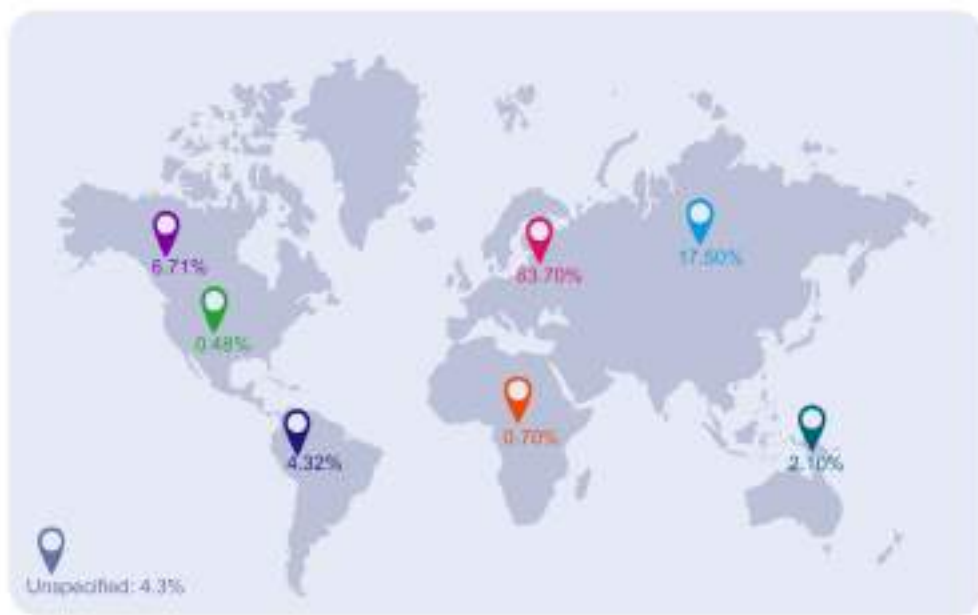
Figure 1_Pfaar et al.