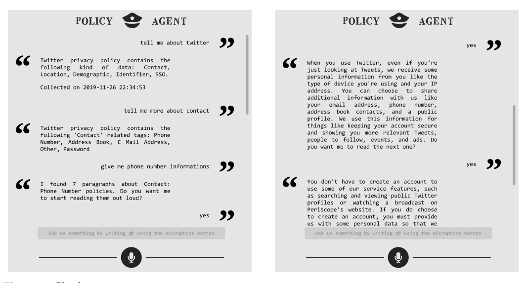
Figure 3. Chatbot prototype.

Figure 3 shows an example of the session during which the user asks the chatbot about the privacy policies of Twitter, asking for further information about the way the service handles contacts, and in particular phone number information. Of course, the user can interact vocally with the agent using a smart speaker like Google Nest.